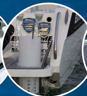
Through swimstep burley muncher