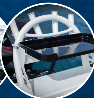
Standard hoop style bait board