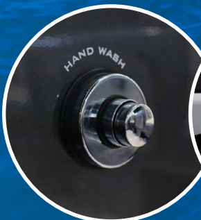
Knee hand wash