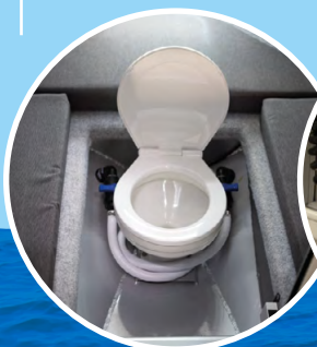
Electric flushing toilet