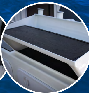
Large box style bait station (760mm wide)