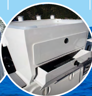
Bait station with 2 drawers