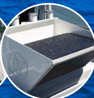
Small box style bait station (510 mm wide)