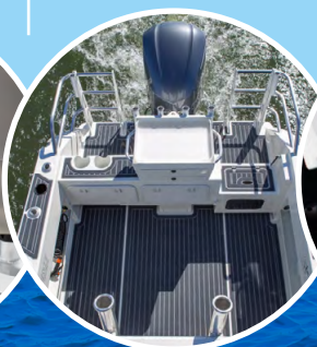
Dark grey over light grey straight lines