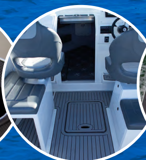
Chilly bin module with King Queen