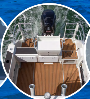
Mocha over black straight lines