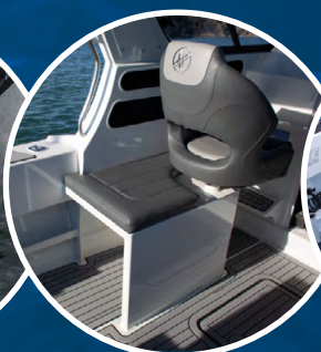
Chilly bin module