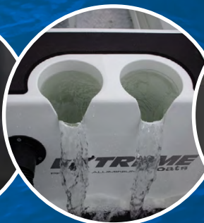
Twin tuna tubes