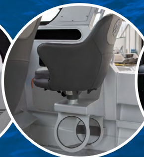
Dive bottle holder