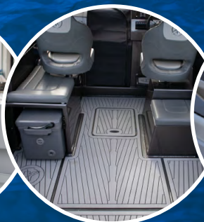
Storm grey over black king plank