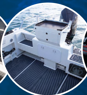
Dark grey over light grey king plank