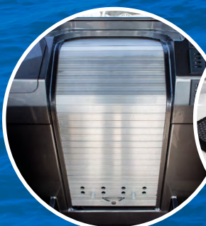
Lockable roller door