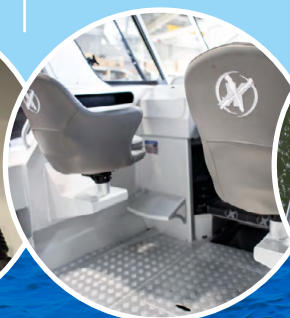
Standard counter lever seating