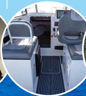
Seating with fridge, sink, two burner cooker, 3 drawers and rubbish bin