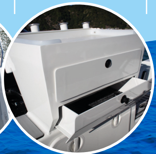
Bait station with 2 drawers