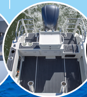
Dark grey over light grey straight lines