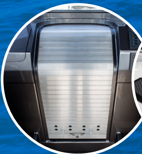
Lockable roller door