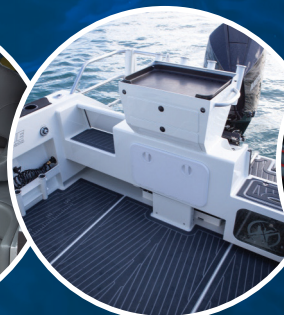
Dark grey over light grey king plank