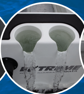
Twin tuna tubes