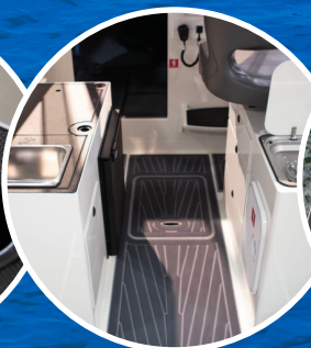
Seating with fridge, sink, two burner cooker, 3 drawers and rubbish bin