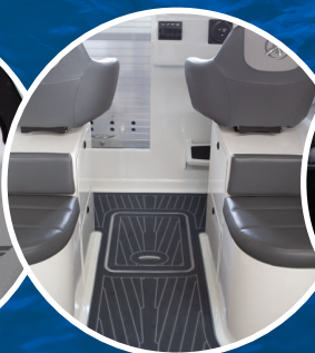
Curved seating with 2 drawers and standard seats