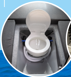
Electric flushing toilet