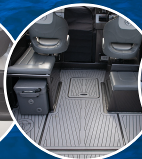
Storm grey over black king plank