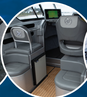
Curved seating with removable backrest and fridge