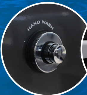
Knee hand wash