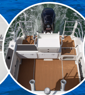
Mocha over black straight lines