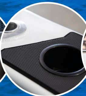
Drop in cup holder