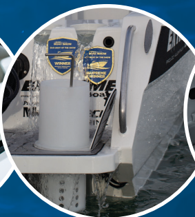
Through swimstep burley muncher