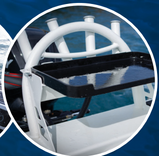
Standard hoop style bait board